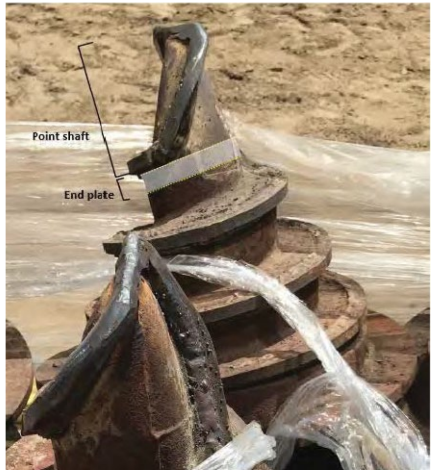
J.A. 1269.<sup>2</sup> Substructure's expert testified that this highlighted region of the accused pile tip is an "end plate" having two "substantially flat surfaces"—a first surface "fac[ing] the interior of the pile tip" and a second surface "that interfaces with the point shaft." Id. Substructure's expert further testified that the point shaft is a "protrusion" extending outwardly from the alleged end plate of the